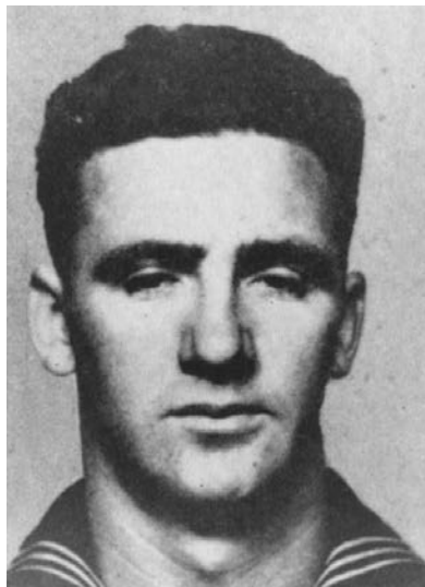
February 17, 2017