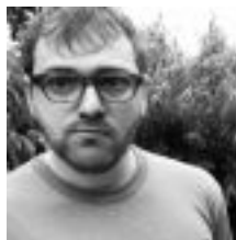
Michael Ballaban 6/07/14 2:00pm Filed to: Boatlopnik