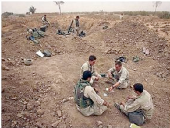
...to listen to his son whine about being bored.