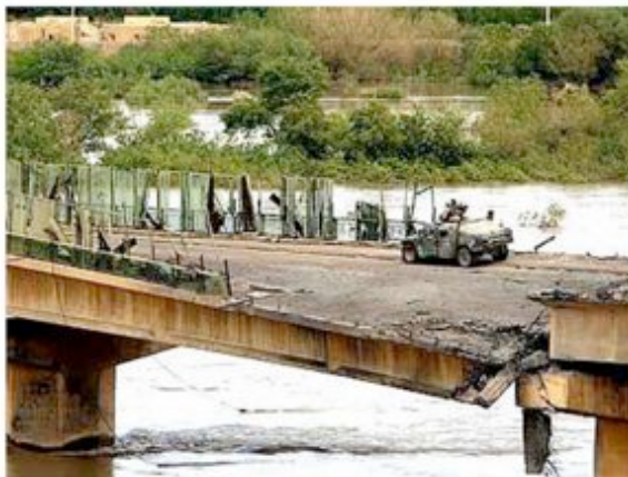
....to keep a straight face when people complain about potholes about potholes.