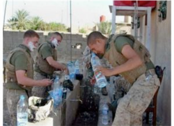
to be tolerant of people who complain about the hassle of getting ready for work...