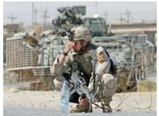
.....to be civil to people who complain about their jobs.