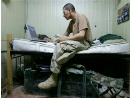
When a soldier comes home, he finds it hard....