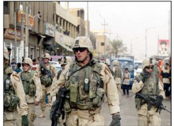
....to keep from ridiculing someone who complains about hot weather.