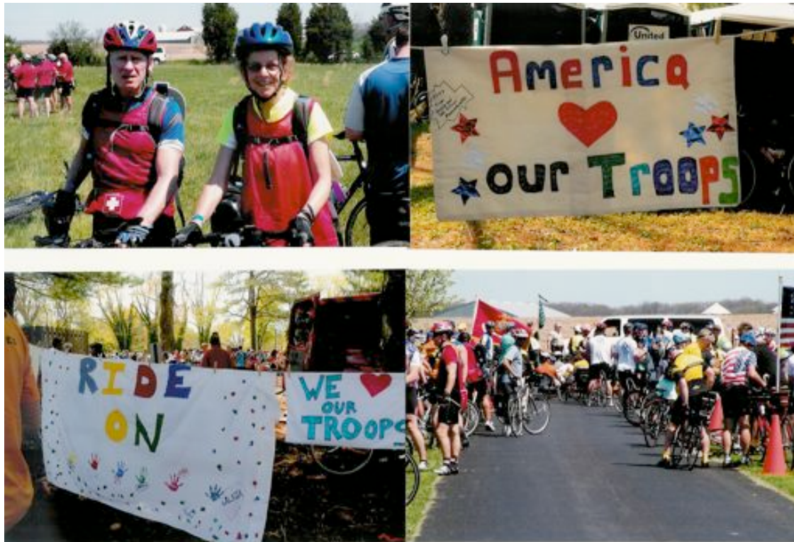
Photos above from Top Left: 2 Volunteer EMTs from Point Pleasant Boro, NJ, EMS who have rendered assistance to our troops for the past two years; Top Right: Supporters along the bike route; Bottom Left: Supporters at start of Team Ride; Bottom Right: Participants cueing for start of event.

Photos at right are rest stations along the bike route, which started in Bethesda, MD and ended at Gettysburg, PA.