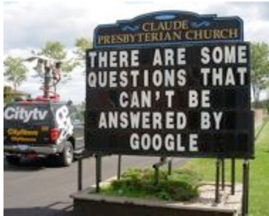
Church can be hilarious!