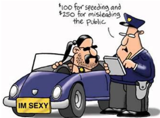
$100 for speeding and $250 for misleading the public