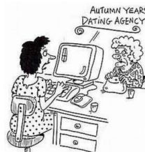
"It says here that you'd prefer someone with regular bowel movements. Does it matter if they're involuntary?"