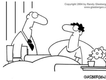
"How are things going at work? During your colonoscopy, we found a shoe."