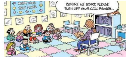
BEFORE WE START, PLEASE TURN OFF YOUR CELL PHONES...