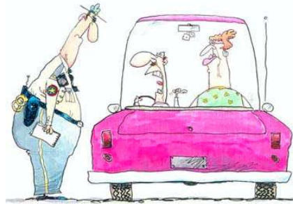
SHE'S DOING ALL THE DRIVING. I'M JUST THE ONE BEHIND THE WHEEL!