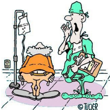
"Yes! That was very loud Mr. Trainer, but I said I wanted to hear your HEART!"