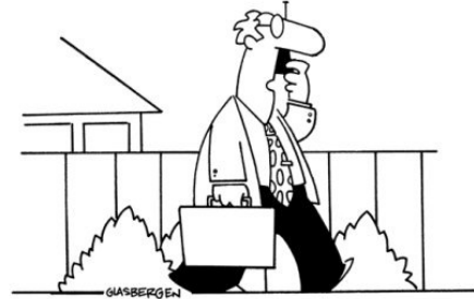
"The bank helped me get back on my feet. They repossessed my car."