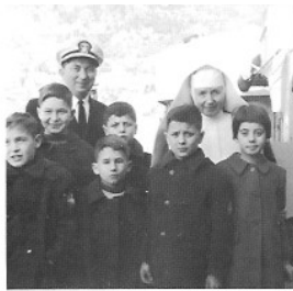
The Captain says hello.