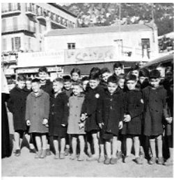
Well disciplined aren't they.