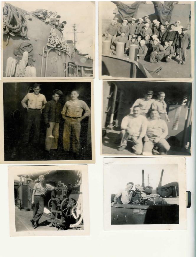
Moose has the mustache.